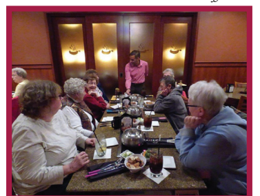
Melting Pot Lunch