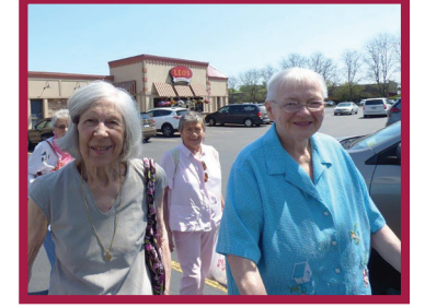
Leo's Bakery Outing