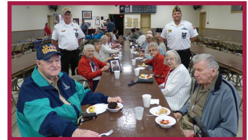
D-Day Ceremony at Fairport VFW