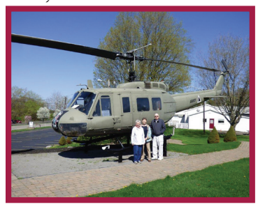
VE-Day Ceremony at Fairport VFW